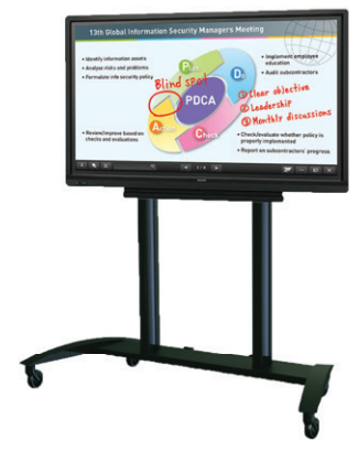
Sharp PN-L703B AQUOS BOARD interactive display system shown with optional PN-SR780M rolling cart.